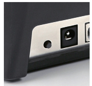
Innovative "C" button makes label Calibration simple and fast