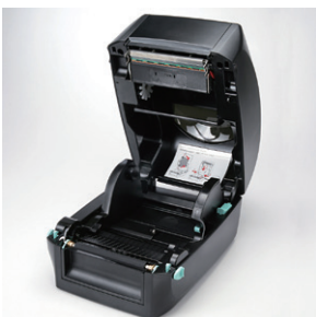
Modern clam-shell design makes it simple to load labels

Advanced multi-purpose 4" desktop printer for light to medium duty applications. With its powerful and reliable features, RT700 is the best choice for retail and industrial applications