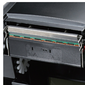
"Twin-Sensor" technology allows you to use a broad range of labels