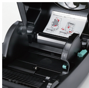
Rod-less label roll holder for easy loading and smooth feeding